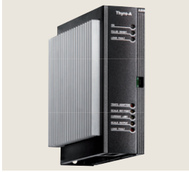
Thyro-A 1A H1 / H RL1 / H RLP1 SINGLE PHASE POWER CONTROLLER