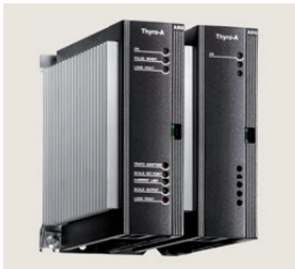
Thyro-A 2A H1 / H RL1 / H RLP1 DUAL PHASE POWER CON- TROLLER FOR THREE PHASE LOADS WITH THREE PHASE CIRCUIT