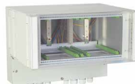
D-UG 660 G66/2