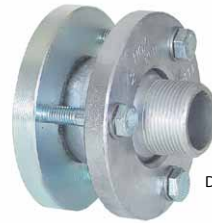
D-ZS 033 I